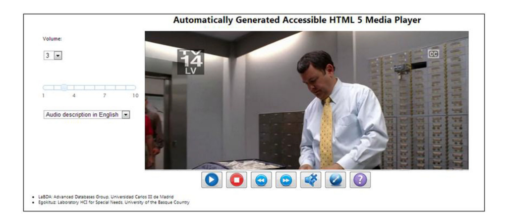
Figure 6: FUI coded with HTML5