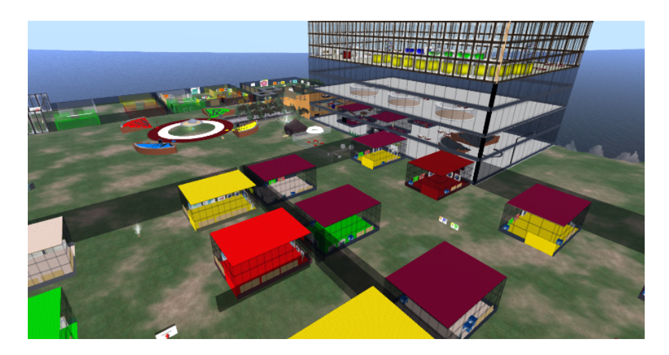
Figure 1: The VirtualSHU Virtual World