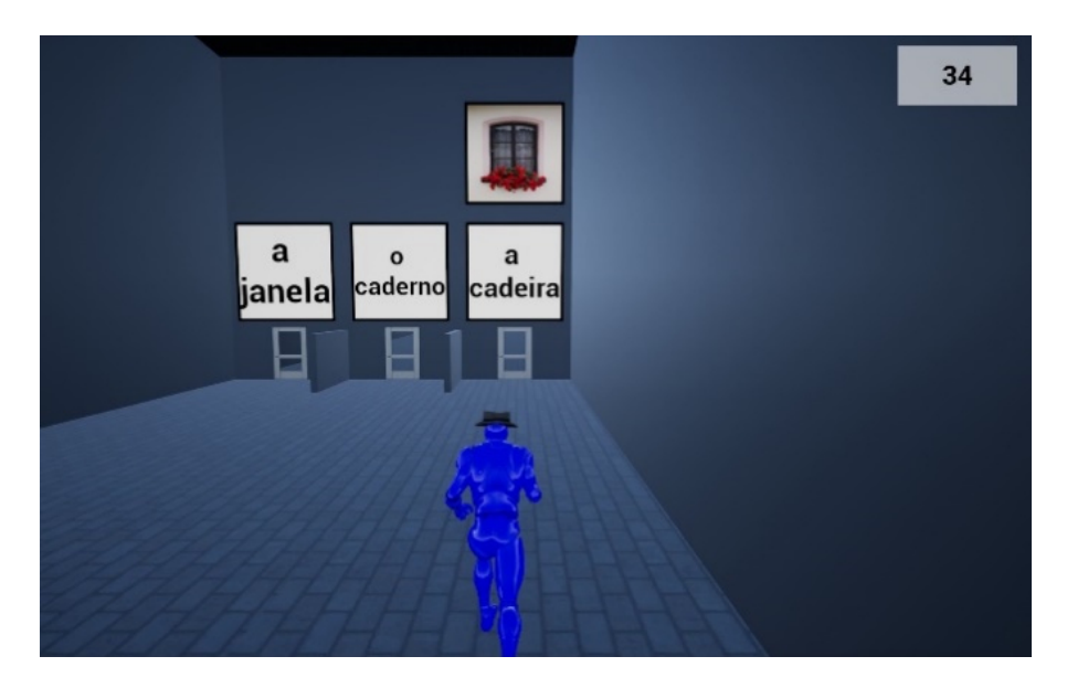
Figure 2: ELLE over-the-shoulder for PC, no match selected

The PC sidescroller version of ELLE is also played on a desktop computer but takes a side view of the avatar, which is continually running from left to right (Figure 3). This version has the player use the space bar to make the avatar jump over logs (in lieu of brick walls) and use the same key to jump when the term to be translated is directly under the correct match. This version went through several iterations to keep the controls intuitive but also allow the player adequate time to read the term and all of the choices. The version in the study appears to "jump ahead" of the avatar, presenting the player with the term and matches a few seconds before the avatar "arrives" at the puzzle. When the avatar reenters the screen, the term and its yellow arrow moves left to right under each of the 3-5 choices (3 for easy, 4 for medium, 5 for hard). The player must hit the space bar while the arrow is beneath the correct match. As in the other versions, if players select the correct match, the door opens for the avatar, and if they do not, the avatar "breaks" through the doorway. Like the other versions, players earn 10 points for correct matches and 1 point for dodging each obstacle.