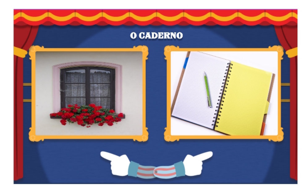
Figure 4: This or That, no match selected

Thus, the four games, while containing the same basic mechanic of matching terms and translations across formats, have different user interfaces. ELLE VR players point and click handheld VR controllers while using their whole bodies to move left and right to avoid walls. ELLE OTS has players use the keyboard's left and right arrow keys; ELLE SS relies solely on the keyboard's spacebar, and TOT has players click with the computer mouse. These are summarized in Table 1 as an easy reference to the main input differences in each condition.