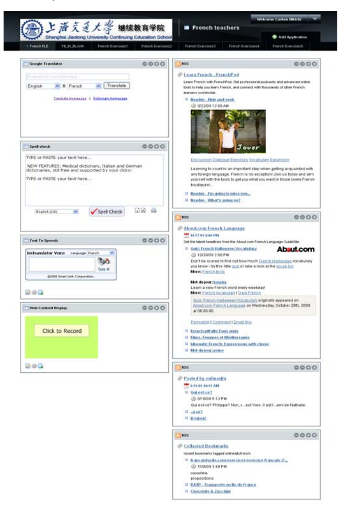
Figure 1: Screenshot of the SJTU prototype

"Grammar" (a grammar book that was collaboratively created during class) were created and extended with a large number of exercise pages that contained multiplechoice exercises for testing several aspects of the French language. Figure 1 shows an early version of this system.