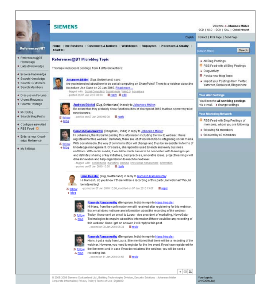
Figure 1: A topic within the References@BT microblog

Though the microblogging service was tightly integrated into References@BT, a series of actions were taken to raise the awareness amongst the employees: