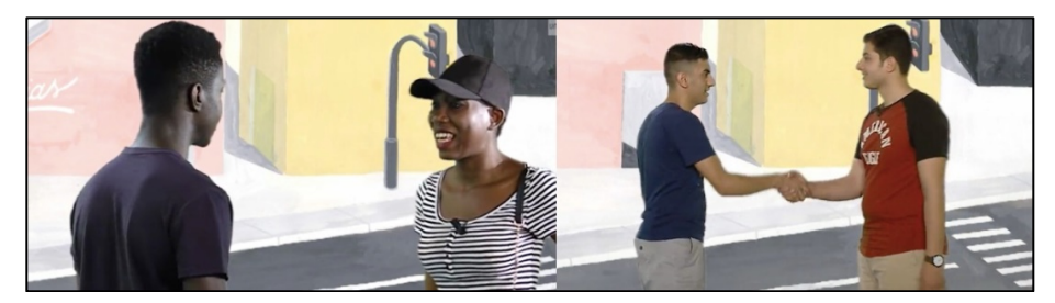
Figure 4: Refugees and migrants on the course videos

This article has presented key aspects to be taken into consideration for the design, development and deployment of inclusive LMOOCs. After undertaking a needs analysis of the population of refugees and migrants in Spain and their expert teachers at NGOs and support groups, a set of inclusive design criteria were identified that would need to be taken into account when designing and developing an LMOOC. These criteria were divided into a set of five categories: technology, linguistics, pedagogy, culture and ethics, and institutional policy. Inclusion was not only present in course design but in its development and its deployment phases too. Not only were the courses tailored to include displaced people, with unstable living conditions, who have often suffered considerable trauma, the whole preparation process, from the beginning to the end, aimed to boost their self-esteem, and create a bond with their teachers and their host community without losing touch with their background and identity. In the process of designing the courses' content and structure, migrants and refugees were included in the selection of the topics and contents as part of a face-to-face Design Thinking session. In addition, they participated as scriptwriters of the video and audio dialogues and as the main actors in them (together with their teachers), as can be seen in figure 4.