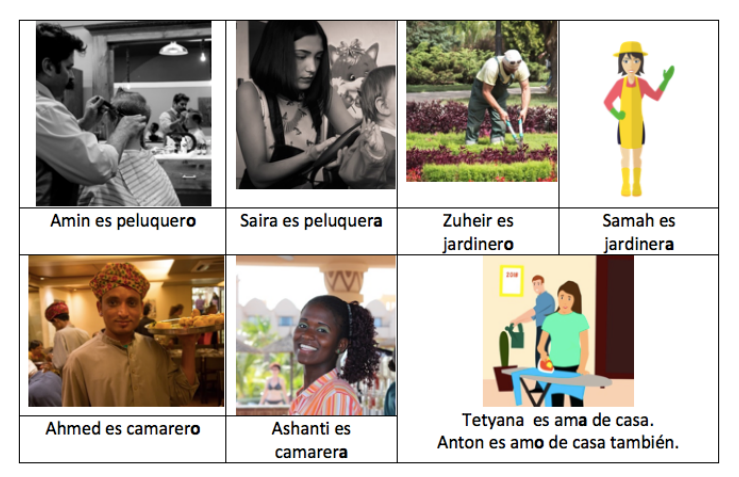
Figure 3: Example of material with attention to diversity

The more advanced students helped translate the videos and audios for the transcriptions and corresponding glossaries into Arabic, under their teachers' supervision. In the course development process, other displaced people keen to collaborate with the initiative of the LMOOCs participated in the course's piloting phase, testing contents and activities and providing feedback on usability, etc., to the course developers. In total, three pilot sessions were carried out before launching the first edition of the LMOOCs, with the assistance of highly heterogeneous groups of displaced people (according to age, nationality, native language and time spent in the host country). Finally, in the implementation process, some of them were appointed as mentors to assist in the facilitation of forums when participants use languages unknown to the teaching staff.