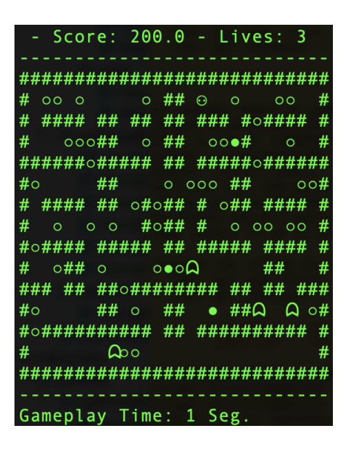
Figure 1: Screenshot of the execution in XGE<sup>+</sup> of the Pacman specification written in XVGDL<sup>+</sup>.